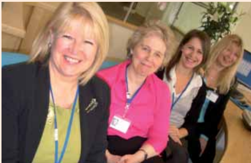
Staff waiting to welcome you at The Ilfracombe Centre

Or alternatively, you can email us at customerservices@northdevon.gov.uk , call us on 01271 327711, or visit our website www.northdevon.gov.uk