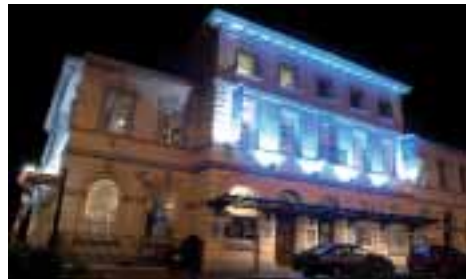
The Queen's Theatre

The College's Reception Lounge has been refurbished. £49,000 contributed to the cost of refurbishment for the dual use dining and teaching area.