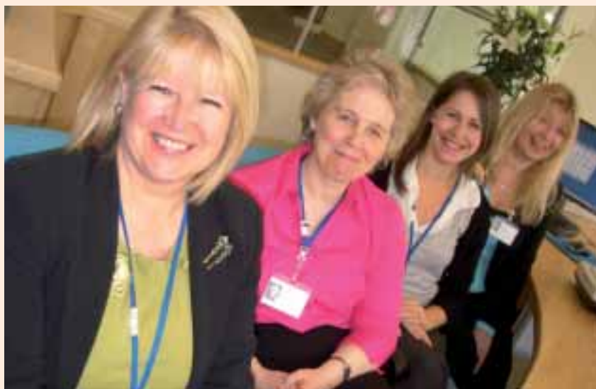
Staff waiting to welcome you at The Ilfracombe Centre

Or alternatively, you can email us at customerservices@northdevon.gov.uk , call us on 01271 327711, or visit our website www.northdevon.gov.uk