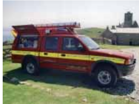
The new fire appliance on Lundy Island

The central government Department for Communities and Local Government (CLG) has provided the Authority with an increase in its grant allocation for 2008/9 of 2.1%, and an indication that its settlement for 2010/11 will be 2.3%. The government's Comprehensive Spending Review 2007 (CSR 2007) requires local authorities to deliver efficiency savings every year.