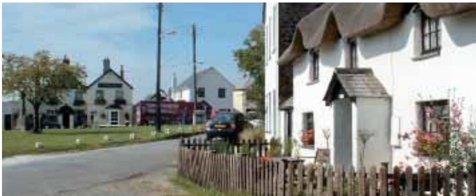
Supporting the economy at the heart of communities is our key priority

We are helping the food and drink sector by running a series of business workshops covering topics such as developing websites, eMarketing, eCommerce as well as more traditional business support. Grant funding is also available to help local businesses take advantage of the latest technology.